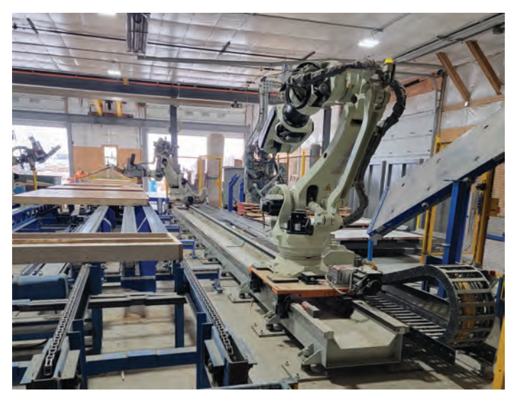
The Kawasaki BX250L robot can lift 250 kg, and offers a through-arm cable design for added convenience.

Factory assembly of prefabricated homes is done in two stages. First, wooden studs and beams are sawn and assembled to form the skeletal walls, roof, and floor trusses. The next phase involves applying OSB sheathing to pre-framed walls, nailing the panels to the framework, and carving out holes for windows and doors. The component parts are then shipped to the building site, where they are assembled into a standing structure.