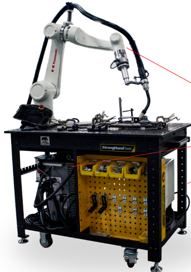
SKS With Accessories Package