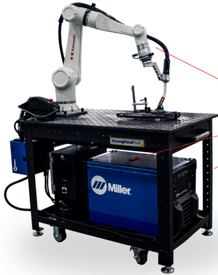
Miller Weld System