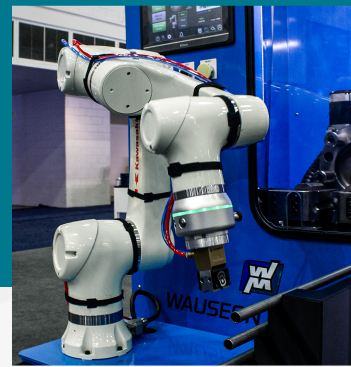
Kawasaki CL Series Robot Payloads from 3-10kg, and maximum reach 1,300mm