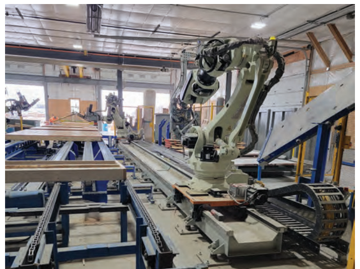
The Kawasaki BX250L robot can lift 250 kg, and offers a through-arm cable design for added convenience.

Factory assembly of prefabricated homes is done in two stages. First, wooden studs and beams are sawn and assembled to form the skeletal walls, roof, and floor trusses. The next phase involves applying OSB sheathing to pre-framed walls, nailing the panels to the framework, and carving out holes for windows and doors. The component parts are then shipped to the building site, where they are assembled into a standing structure.