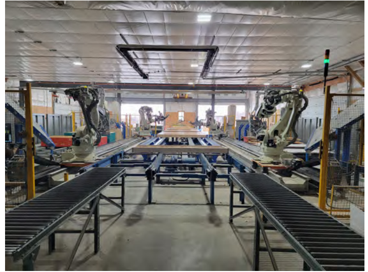
Kawasaki robots are used to mount cumbersome OSB sheathing to pre-framed walls and cut out windows and doors.

Rehkemper's process is extremely labor intensive, which made it difficult to find and retain employees. Automation can be the perfect solution for these situations, as manufacturers can rely on them to work consistently. Kawasaki robots are known for their reliability and flexibility. Offering a 250 kg payload, Kawasaki BX250L robots can easily lift large, cumbersome OSB walls with ease. Their patented hollow-arm structure provides easy installation, maintenance and minimized wear. Their extended reach, high speeds and advanced motion control technology reduce cycle times.