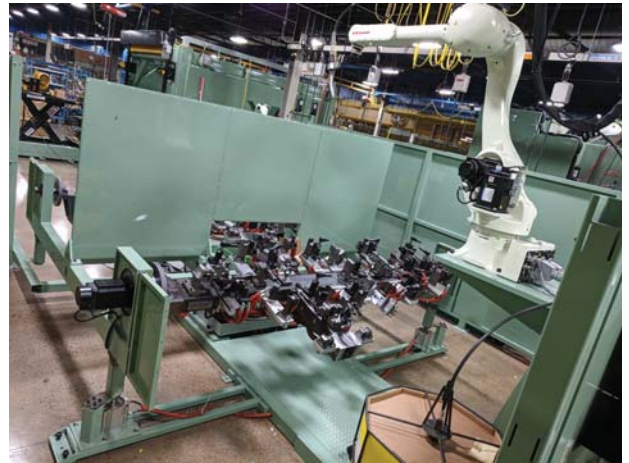
Inside KMM's "Type 3" cell

In the mid-1980s, Kawasaki Motors Manufacturing Corp., USA (KMM) installed their first Kawasaki robots. Growing tired of inconsistent part fit and the constant struggle to find enough welders to keep up with production, KMM's new robots were put to work arc welding their all-terrain vehicle (ATV) and Mule and Teryx four-wheeler frames. Now, 30 years later, the manufacturer uses 71 Kawasaki arc welding robots, and that number will grow to 84 by June of 2019.