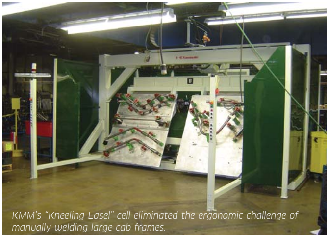
KMM's “Kneeling Easel” cell eliminated the ergonomic challenge of manually welding large cab frames.

The “Kneeling Easel” cell was developed specifically for welding large 6 ft. by 6 ft. cab frames, whose cumbersome shape posed an ergonomic challenge for human welders.