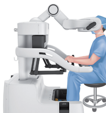
The Surgeon Cockpit is operated by the surgeon.

hinotori™ surgical robot system was developed to realize patient-friendly, minimally invasive surgery. It has already been implemented in a large number of surgeries at over 30 medical institutions.