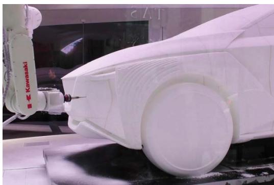
Carving urethane-made raw material.

Kawasaki robots took part in an interesting event at the Nissan's showroom in Ginza, Tokyo from October to the beginning of November. Two Kawasaki's R series robots formed a urethane-made raw material by carving and painted it to create a concept car model.